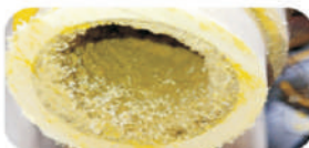
Scaling on Pipes