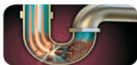
Clogging Water flow reduction in pipes