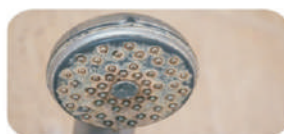
Scaling on Shower heads