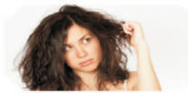
Hair Damage Hair Fall & Split Ends