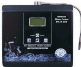
DA-S-105 (5 Plate)