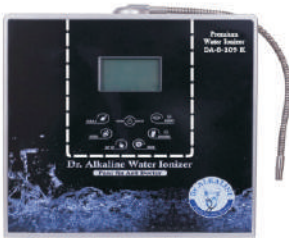
DA-S-109 K (9 Plate)

It prevents diseases such as Arthritis, Cancer, Hypertension, Diabetes, Digestive Problems, Weight Problems, Osteoporosis, Asthma, Allergies, Skin Disorders and Acid reflux. Cleaning of Intestines