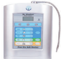
DA-S-103 (3 Plate)