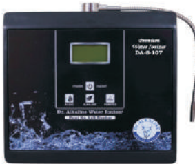
DA-S-107 (7 Plate)